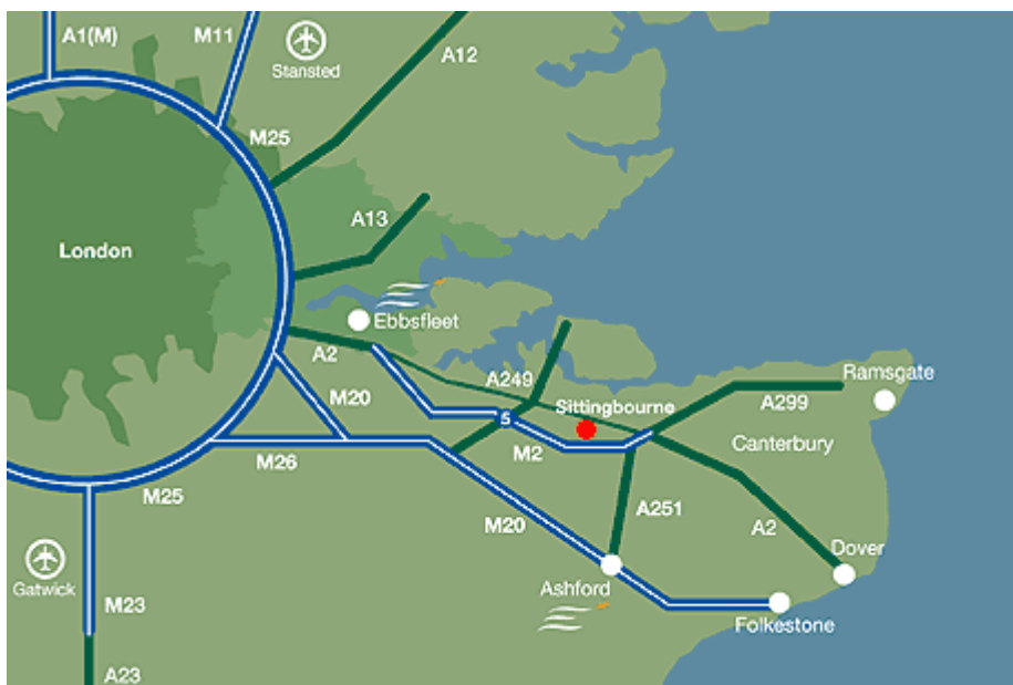
Map of the South East of England showing the location of the Kent Science Park in Sittingbourne (marked with a red dot) and the major roads that lead to the KSP